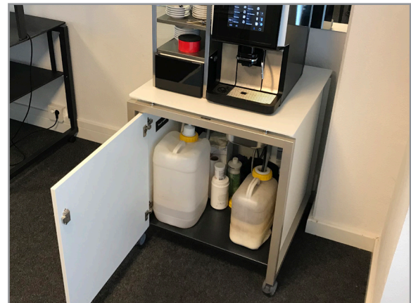
2/3 GN drawer for coffee dregs