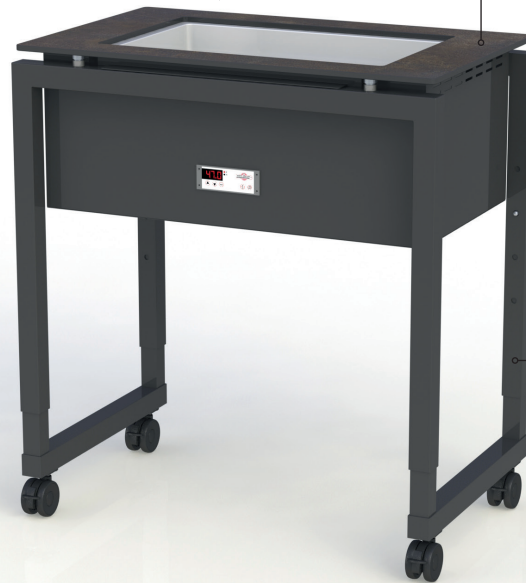
table-top: compact laminate color: ceramic anthracite (402)

base frame: steel, powder-coated color: anthracite (100)