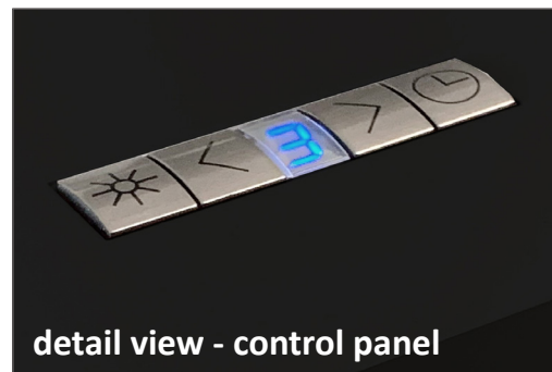
detail view - control panel

The Room Air Cleaner can be installed in your restaurants or meeting rooms to provide fresh air. You can use this device during the pandemic period to clean the air from aerosols. So you can stay in the restaurant without the mouth and nose protection enjoying your meal and also have meetings provided the distance rules (1,5 m) are observed.