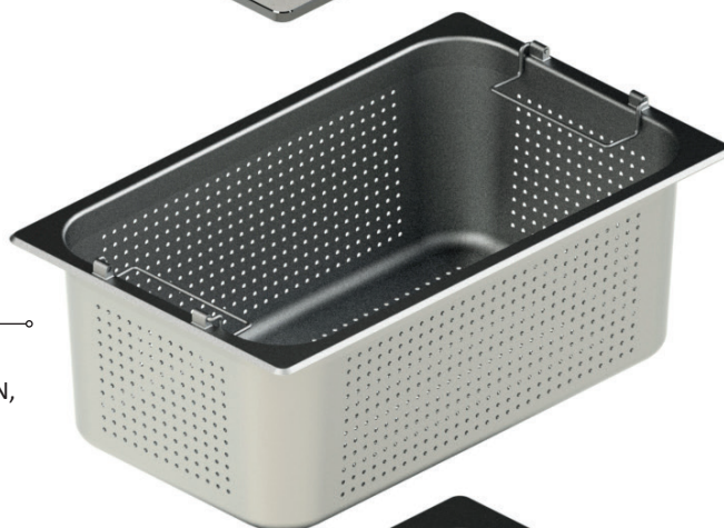
Item No.: 12309 1 x RIEBER® perforated container 1/1 GN, 200 mm stainless steel Aisi 1.4301 brilliant brushed surface