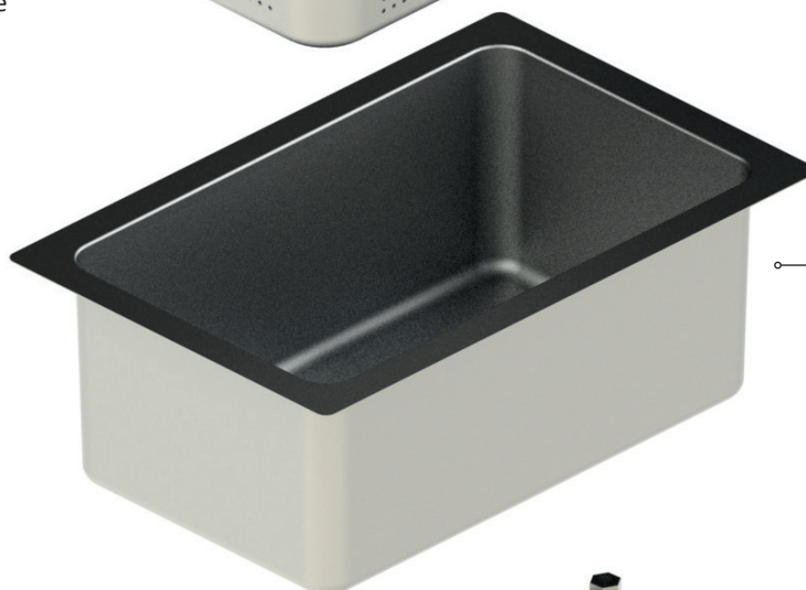
Item No.: 20017 1 x ICE_WELL ELEMENTS by VENTA stainless steel Aisi 1.4301 brilliant brushed surface