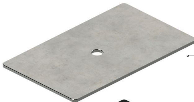
Item No.: 14130 inlay_panel_ ICE_WELL_ELEMENTS