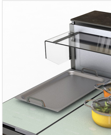
CHEFS TABLE SETUP-2 INDUCTION-COOK + Thermoplate 1/1 GN