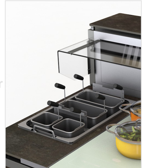
CHEFS TABLE SETUP-4 Pasta-Set_ELEMENTS 1/1 GN