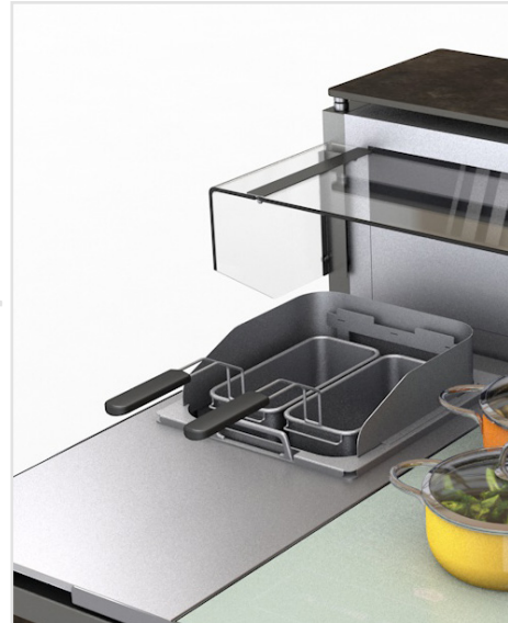
CHEFS TABLE SETUP-3 Frying-Set_ELEMENTS 2/3 GN