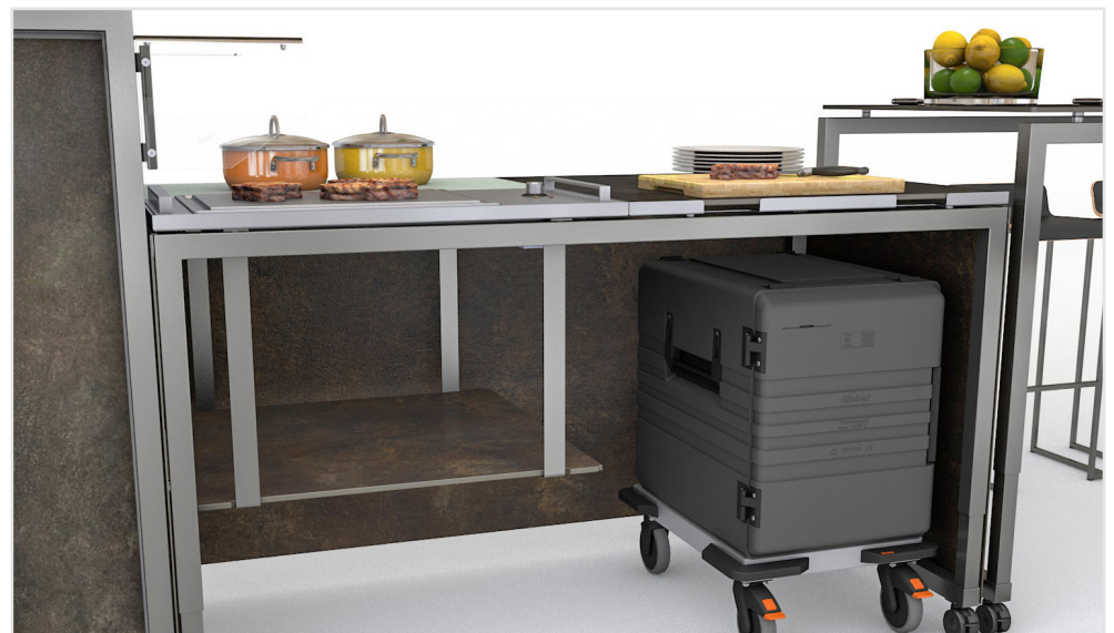
SHELF_47 + Thermobox (by RIEBER) Shelf for extra storage and keeping food warm in thermobox