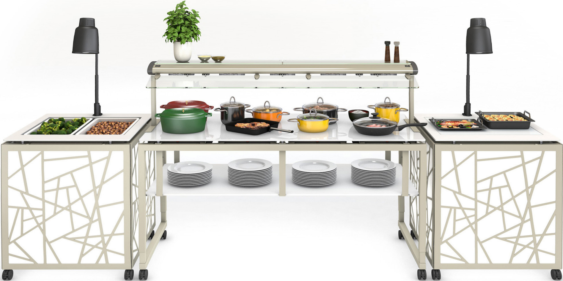
HOT BUFFET SETUP-1 | STAGE_80_M_INDUCTION_VARIO_4 + HEATBRIDGE_180_DS + SHELF_STAGE_80 + STAGE_80_XS_COOL+HOT + STAGE_80_XS_BAIN-MARIE_COOL+HOT + HEAT_LAMP_STAY_HOT + BLINDS