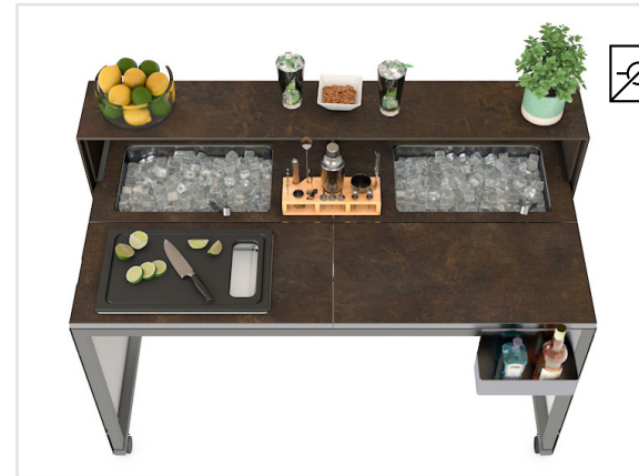
MOBILE BAR SETUP-1 STAGE_80_S_ELEMENTS_4 + TOP_BOX + SPEEDRAIL