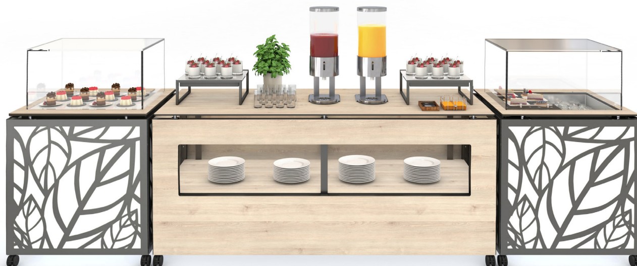
COLD BUFFET SETUP-3 STAGE_80_L + SHELF_47 + STAGE_80_XS_COOL+HOT + STAGE_80_XS_BAIN-MARIE_COOL+HOT + STAGE_ETAGERE_COOL_SQ + ACRYLIC_DISPLAY_HOOD + BLINDS