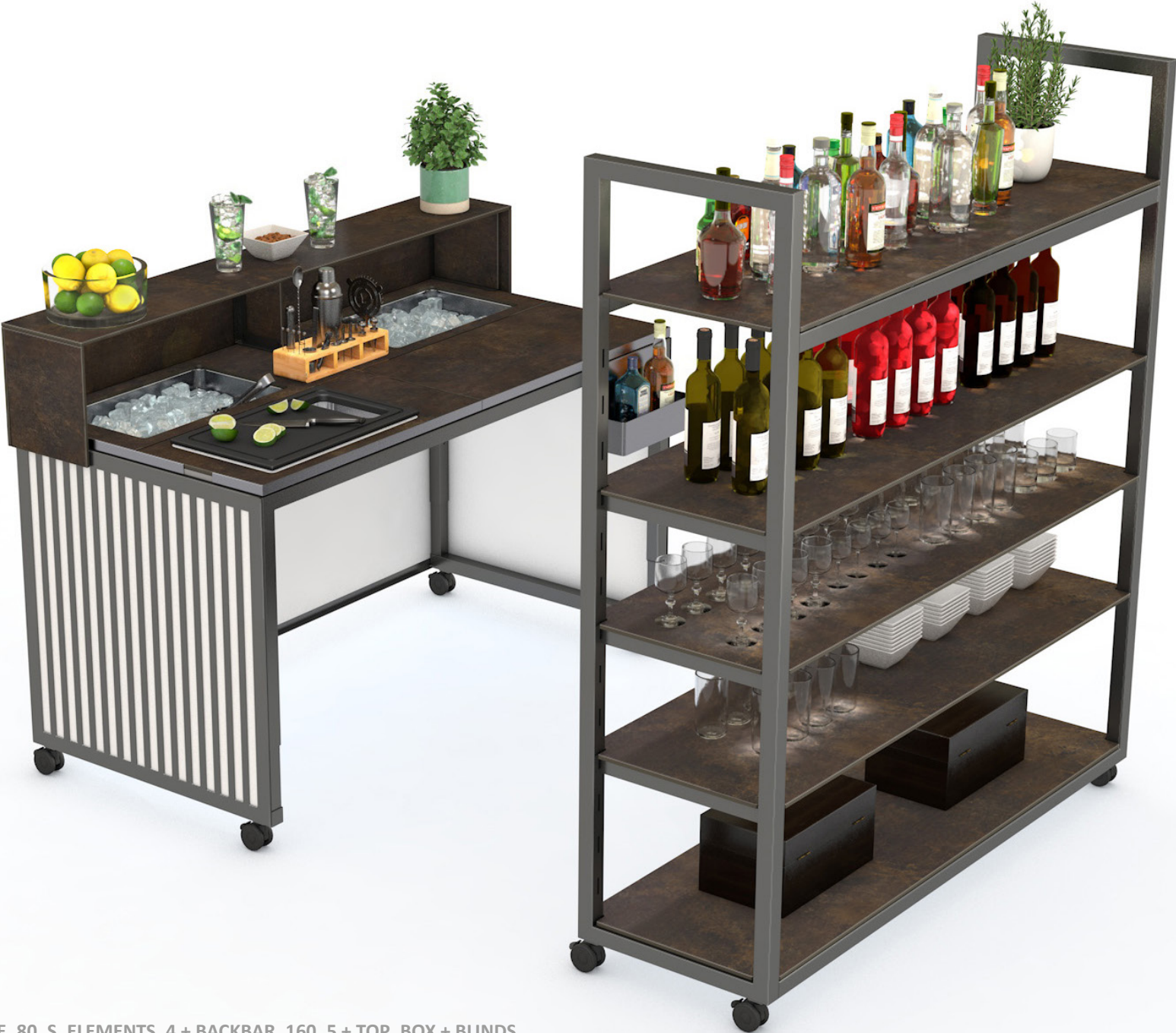
MOBILE BAR SETUP-1 | STAGE_80_S_ELEMENTS_4 + BACKBAR_160_5 + TOP_BOX + BLINDS