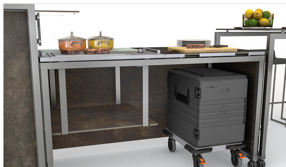
SHELF_47 + Thermobox (by RIEBER) Shelf for extra storage and keeping food warm in thermobox