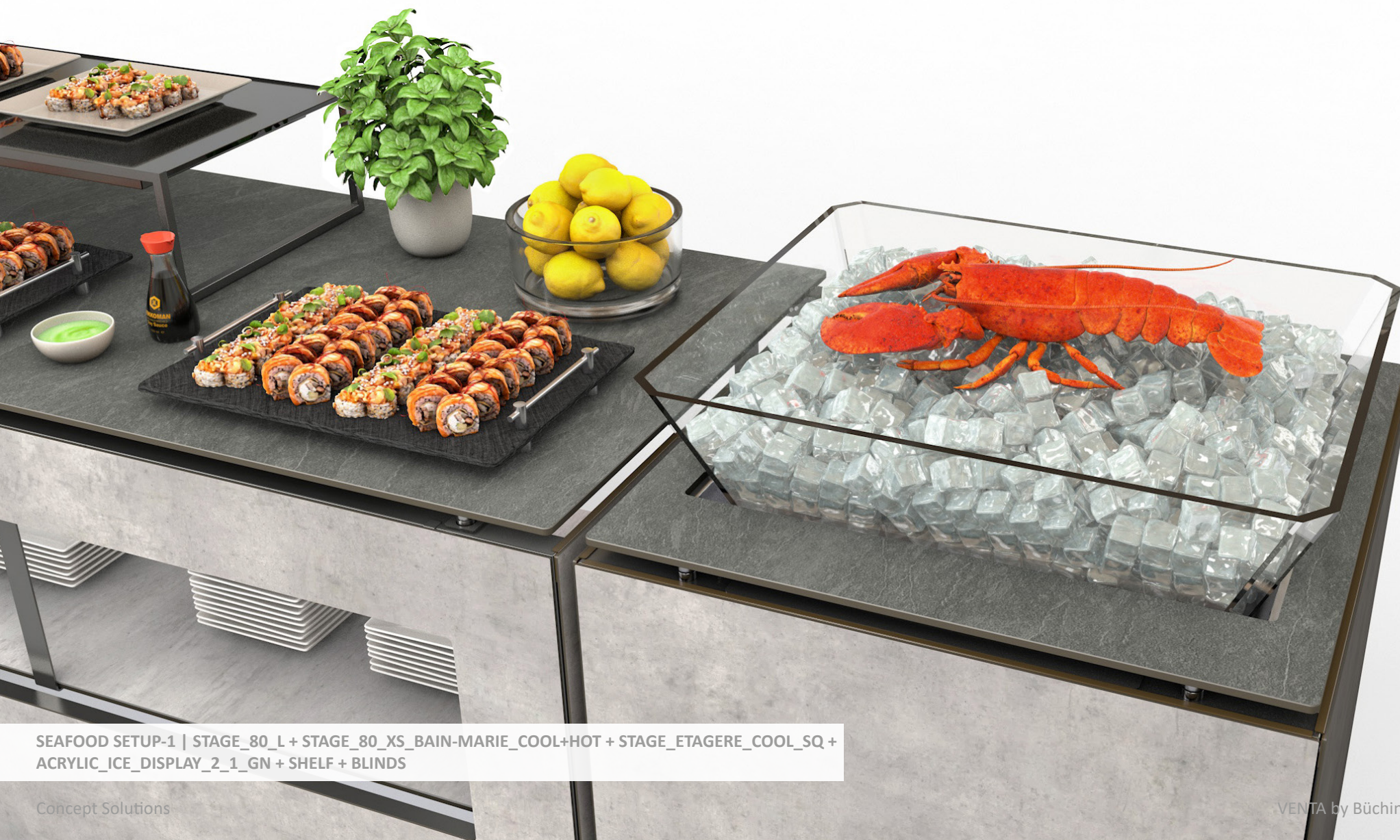
SEAFOOD SETUP-1 | STAGE_80_L + STAGE_80_XS_BAIN-MARIE_COOL+HOT + STAGE_ETAGERE_COOL_SQ + ACRYLIC_ICE_DISPLAY_2_1_GN + SHELF + BLINDS