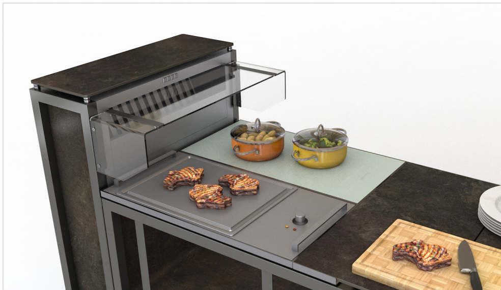
AIRMobil_80 Mobile indoor cooker hood on castors with a 3 filter system