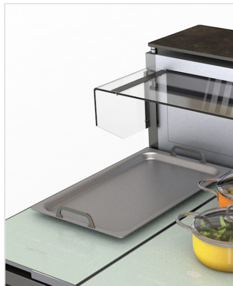
CHEFS TABLE SETUP-2 INDUCTION-COOK + Thermoplate 1/1 GN