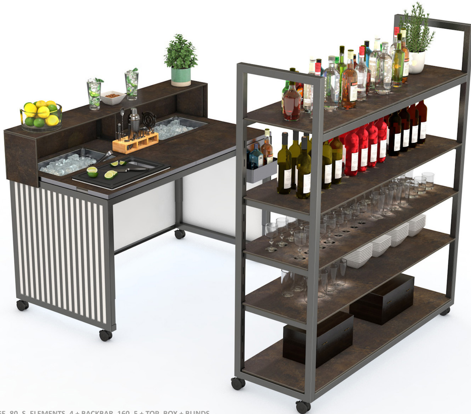
MOBILE BAR SETUP-1 | STAGE_80_S_ELEMENTS_4 + BACKBAR_160_5 + TOP_BOX + BLINDS