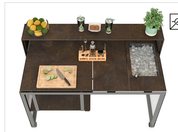
MOBILE BAR SETUP-3 STAGE_80_S_ELEMENTS_2 + TOP_BOX + SHELF_47