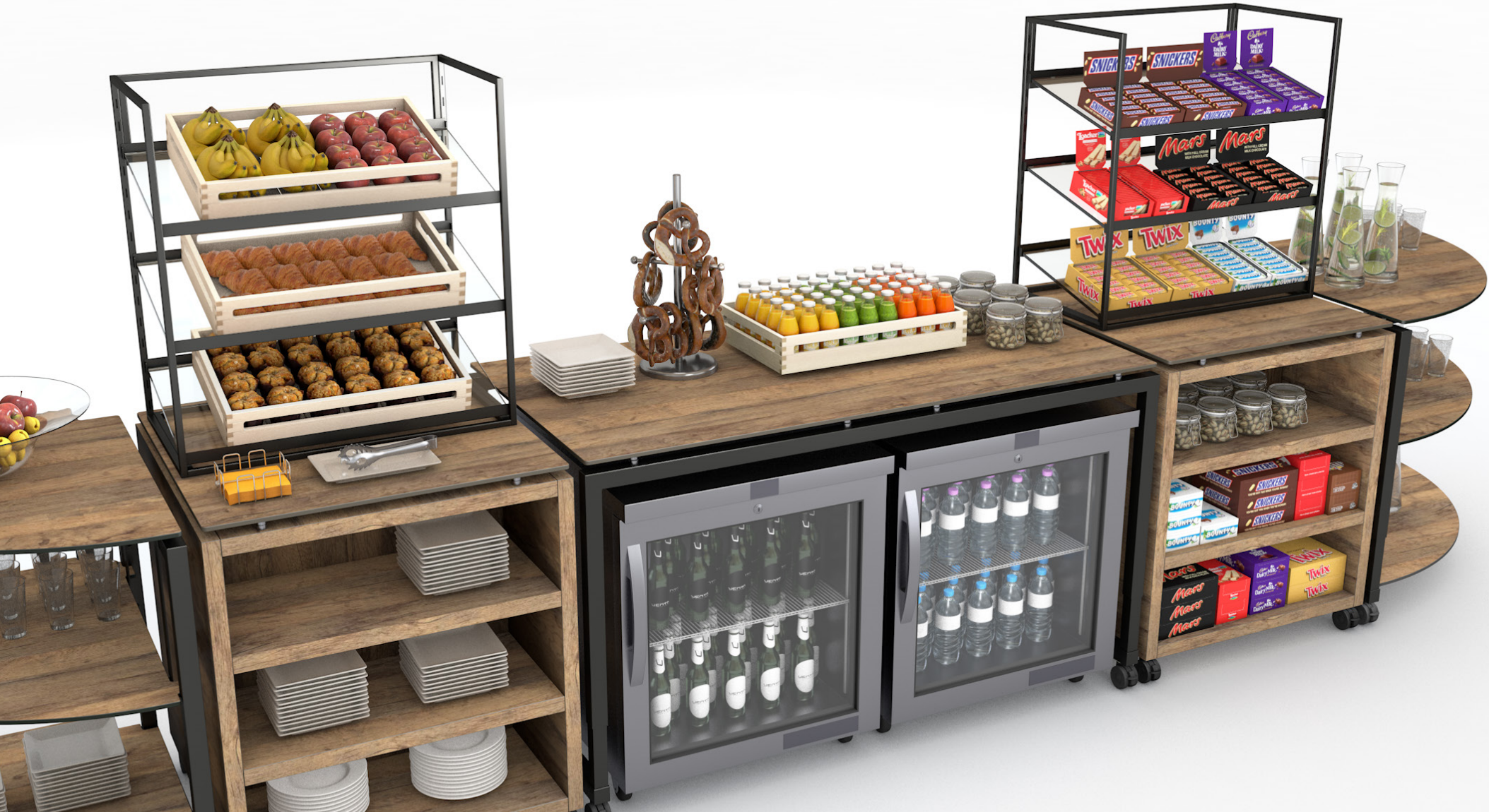
MARKET SETUP-1 | STAGE_80_S + STAGE_80_XS_RACK + TABLE_RACK + STAGE_80_XS_90_RO + SHELF + SHELF_LOW