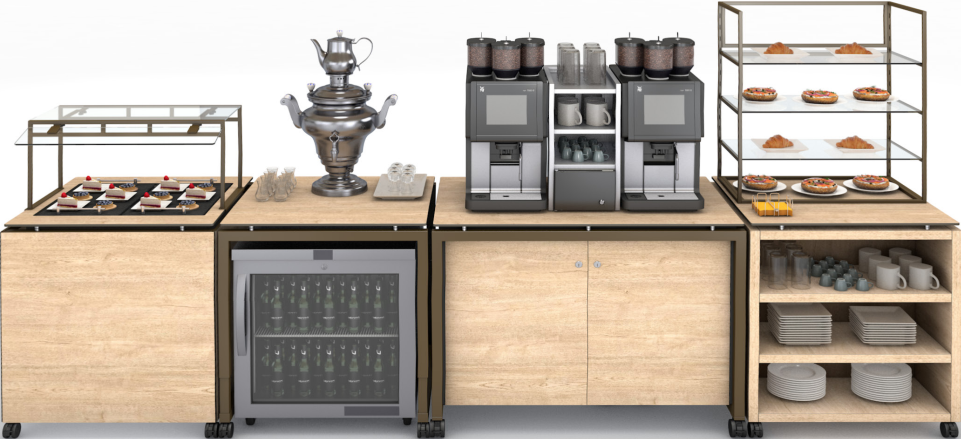
COFFEE AREA SETUP-1 | STAGE_80_COFFEE_STATION_RE + STAGE_80_XS_COOL+HOT + STAGE_80_XS + STAGE_80_XS_RACK + TABLE_RACK + SNEEZEGUARD_STAGE_XS_OS + WMF_1500_Coffeemachine + WMF_CUP&COOL + BLINDS