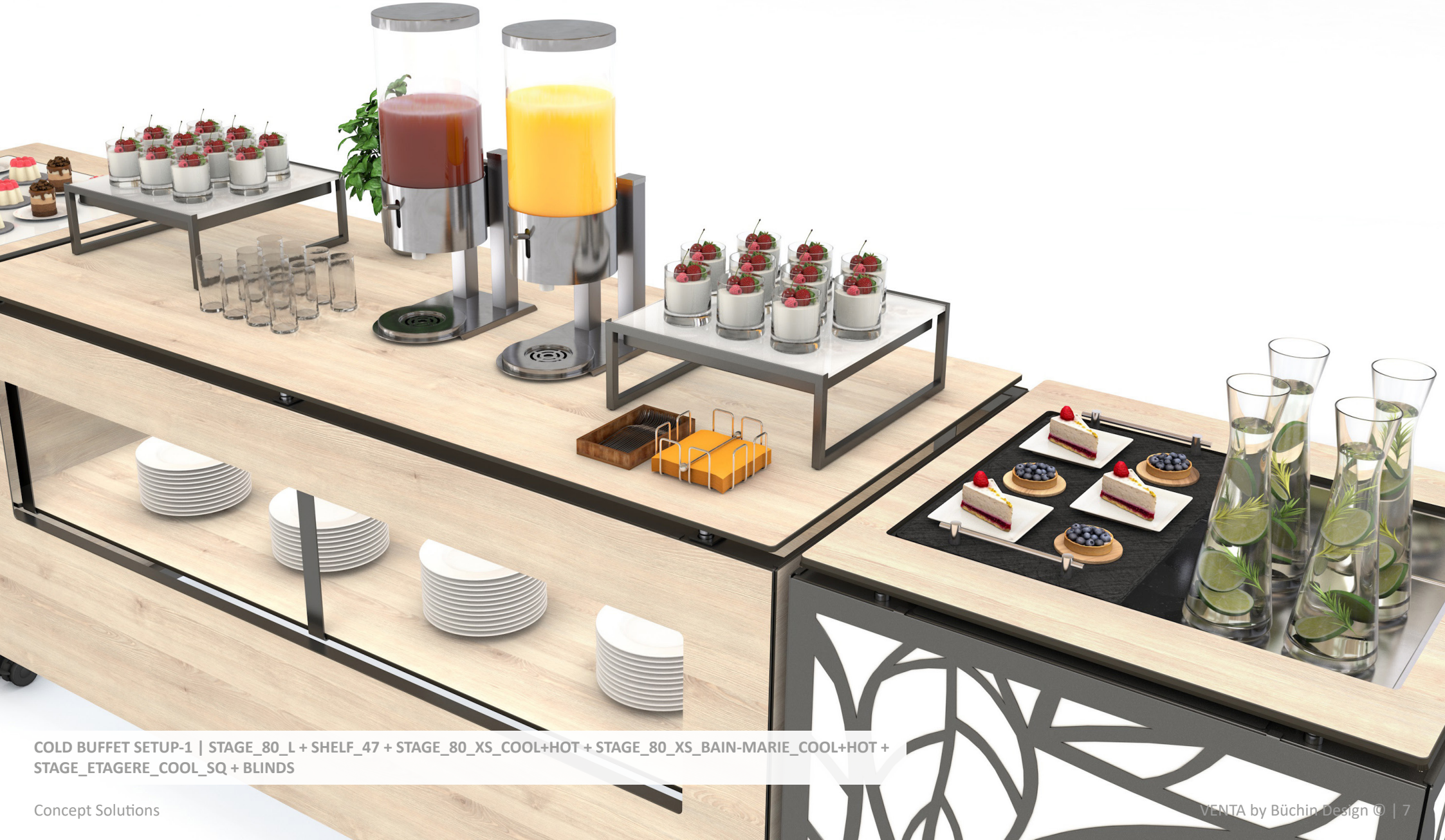
COLD BUFFET SETUP-1 | STAGE_80_L + SHELF_47 + STAGE_80_XS_COOL+HOT + STAGE_80_XS_BAIN-MARIE_COOL+HOT + STAGE_ETAGERE_COOL_SQ + BLINDS