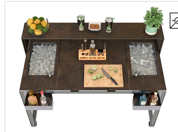
MOBILE BAR SETUP-2 STAGE_80_S_ELEMENTS_4 + TOP_BOX + 2x SPEEDRAIL