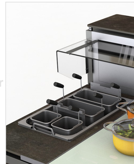
CHEFS TABLE SETUP-4 Pasta-Set_ELEMENTS 1/1 GN