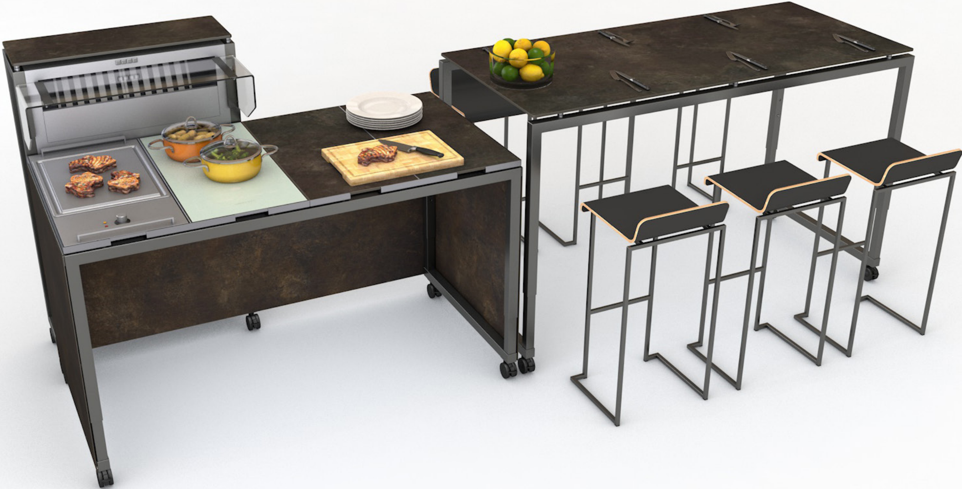
CHEFS TABLE SETUP-1 | STAGE_S_ELEMENTS_4_INDUCTION+TEPPAN + AIRMOBIL_80 + STAGE_80_M + 6x PLATE_37 + BLINDS