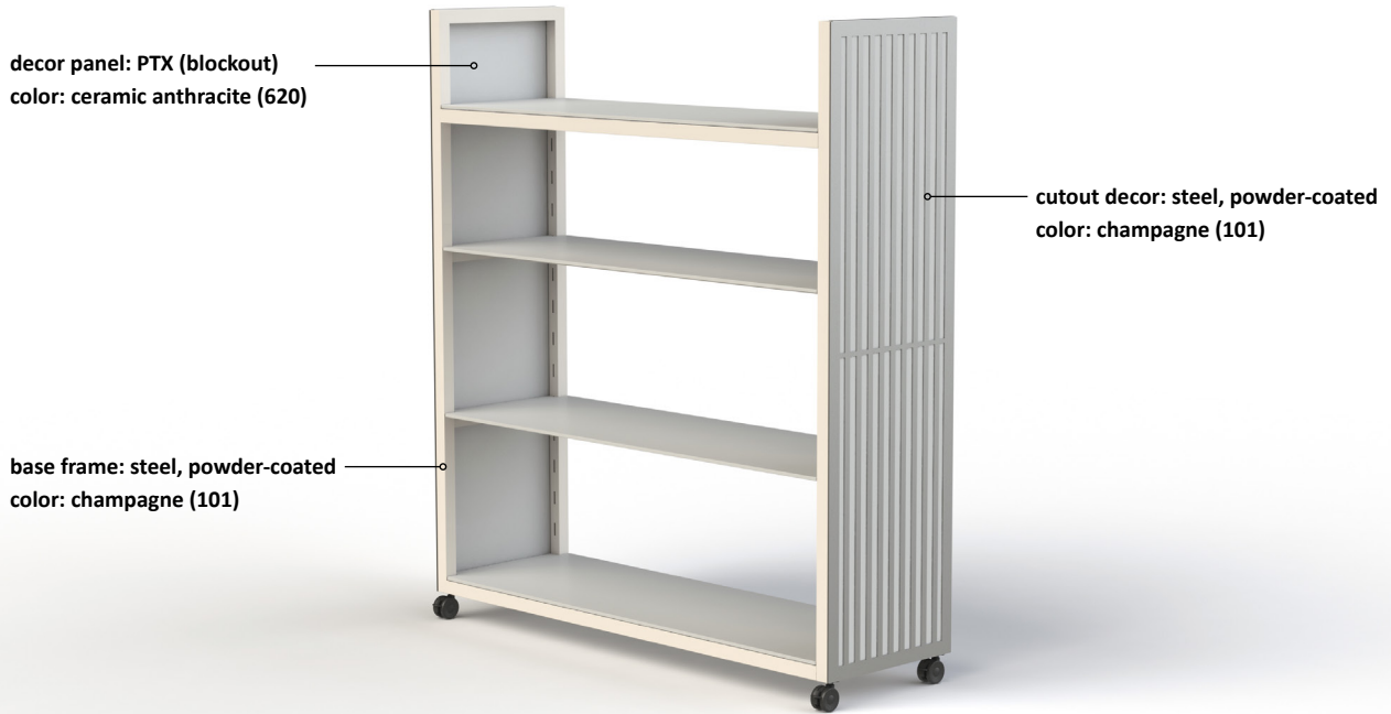
color example 101|101|620