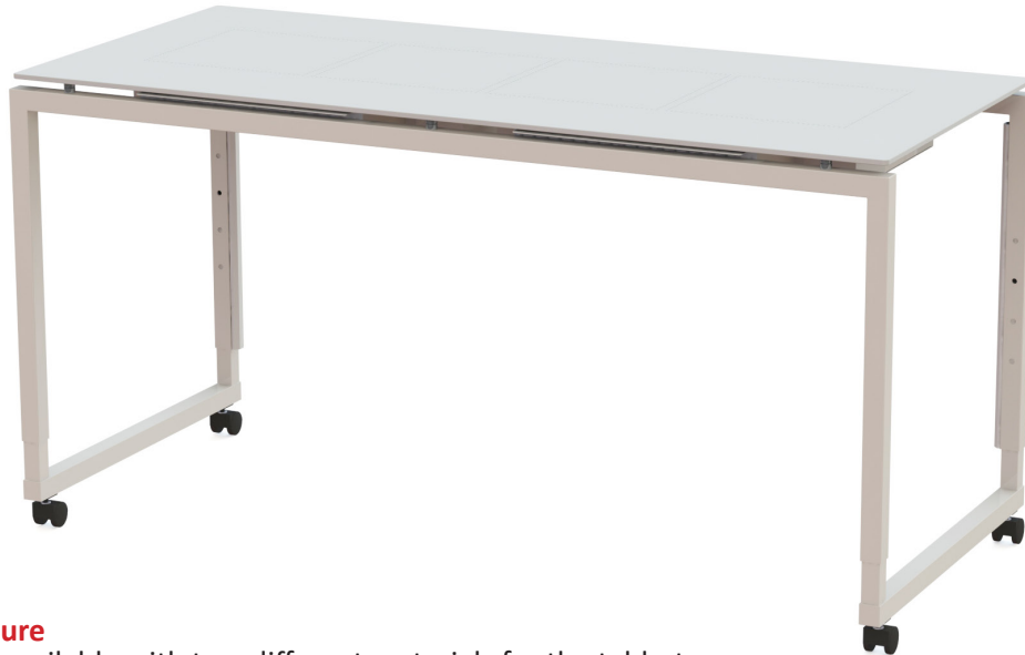
Table with four integrated induction fields to keep the food warm on a buffet. Each induction field can run individually. You can adjust four different levels (40°-90°C). The first level corresponds to approximately 40°C, depending on the used pot. On each induction field (measures: 34 x 34 cm) you can place several pots to keep them warm.

This table is available with two different materials for the table-top. You can choose between glass or compact laminate.